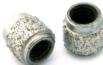
Figure 2- Hybrid Diamond Beads