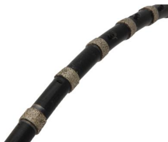
Figure 1 Assembled Hybrid Diamond Wire -